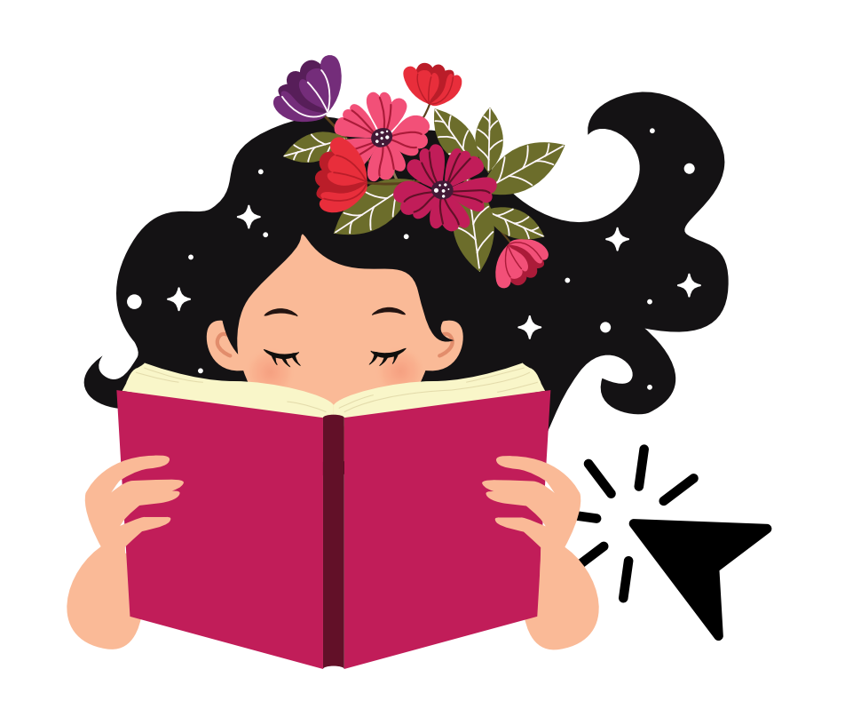
Reading academic texts

Below there are two videos that explain the basics of academic reading and writing.