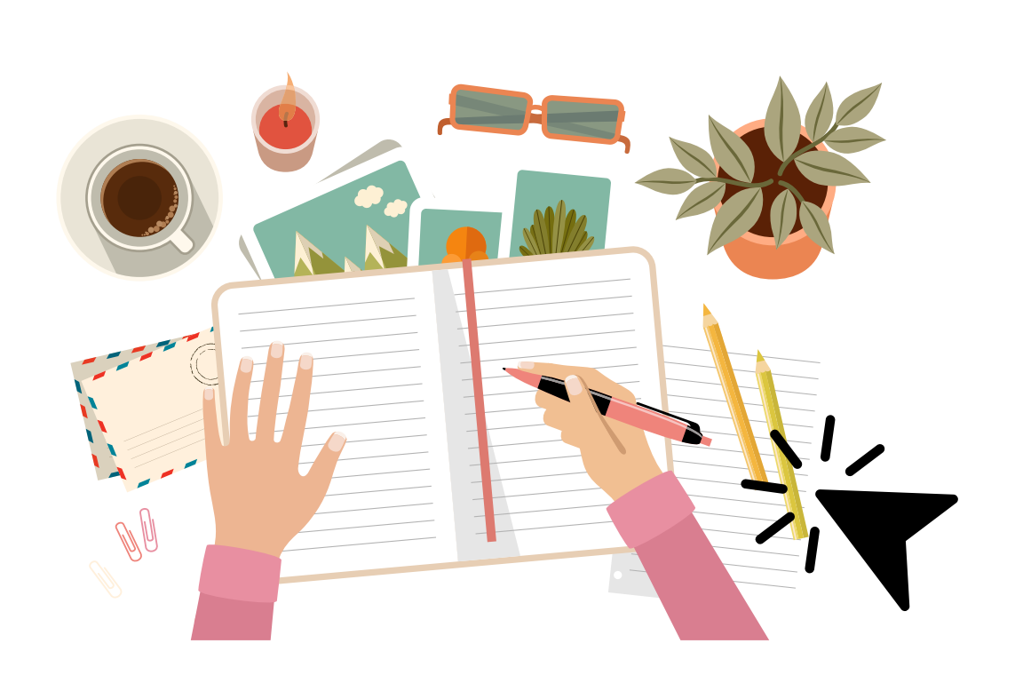
Writing academic texts